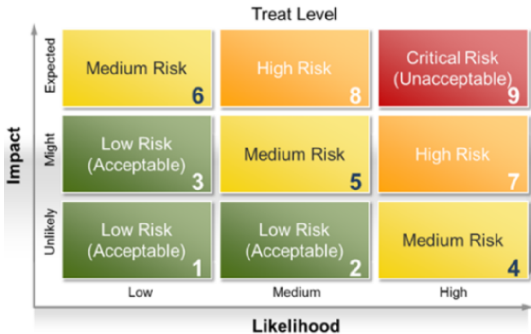
Figure 2: Risk Analysis and