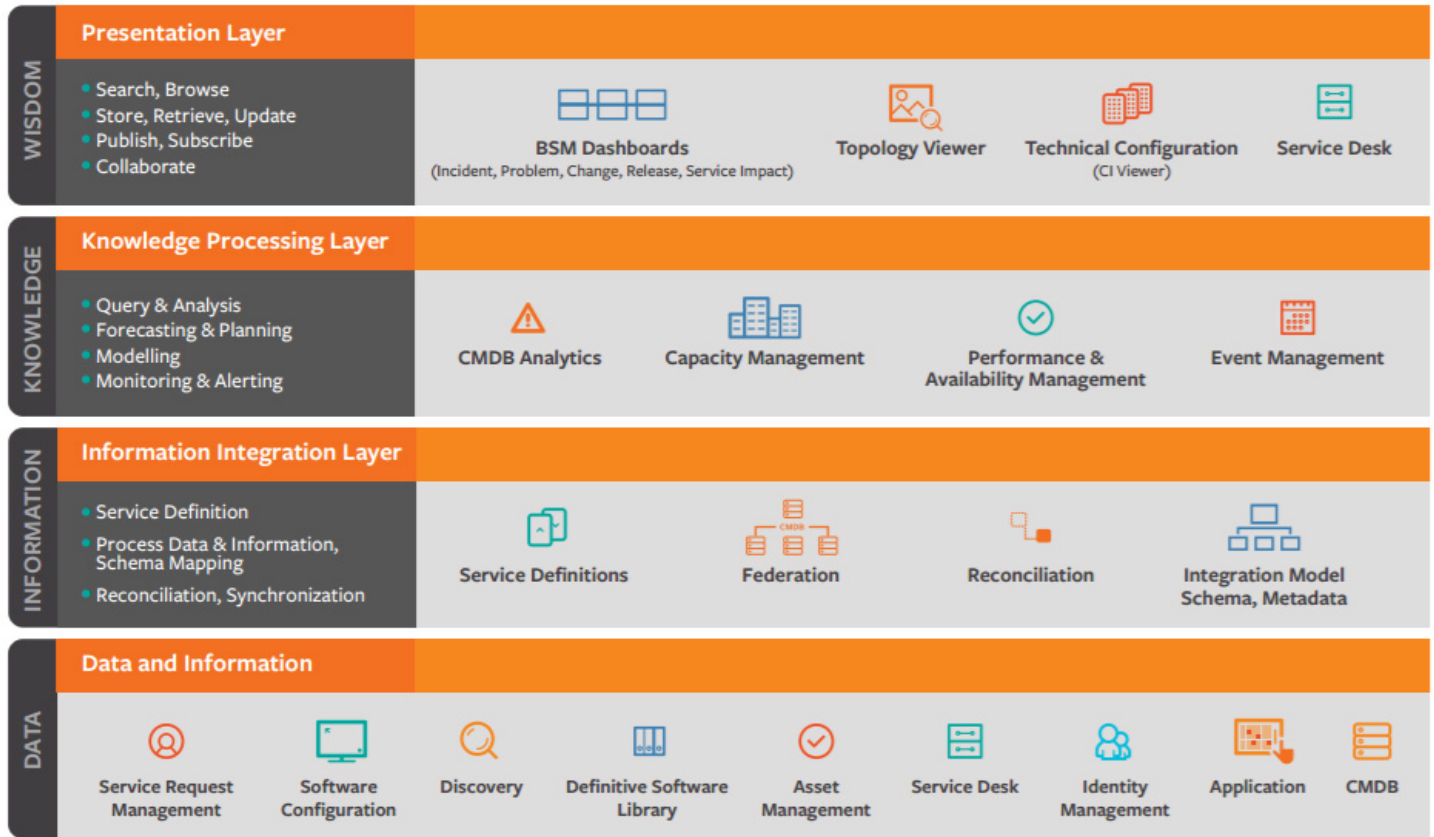
FIG 8: Sample Service Knowledge Management System (SKMS)