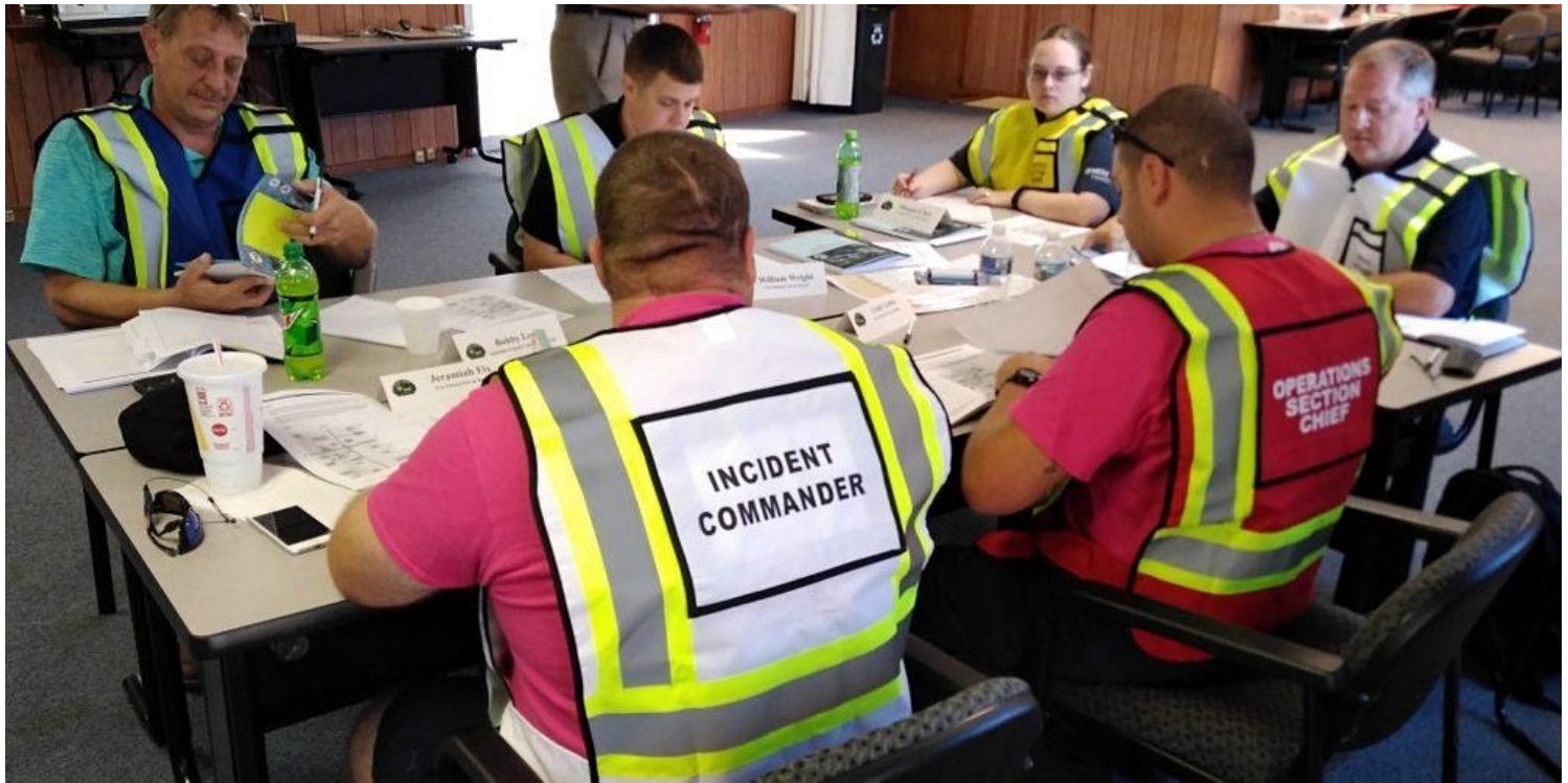
Incident Commander in the war room